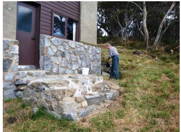
Peter finishing work for the day—western steps