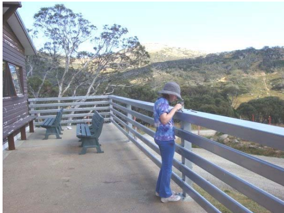
Talia busy working on the front railings