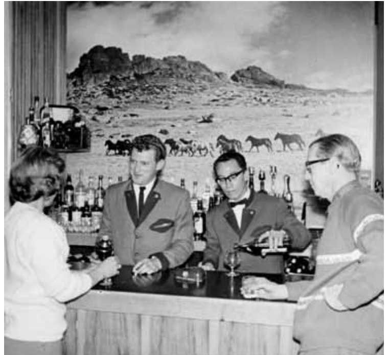
Sobriety and decorum at The Man from Snowy River Hotel.