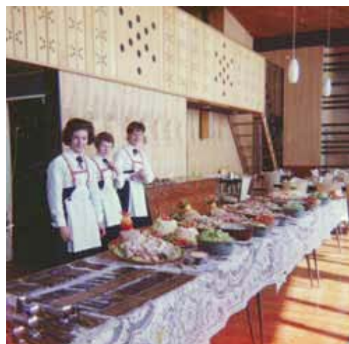
Smorgasbord (Cooper Collection).