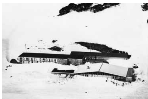
The Man from Snowy River Hotel – the second oldest hotel in Perisher Valley - celebrated its 50th Anniversary in June 2010.

The Man from Snowy River was opened on schedule on 25 June 1960, with 39 rooms, 39 bathrooms, a swimming pool in front and a tennis court. The opening was quite something: employees of Architon