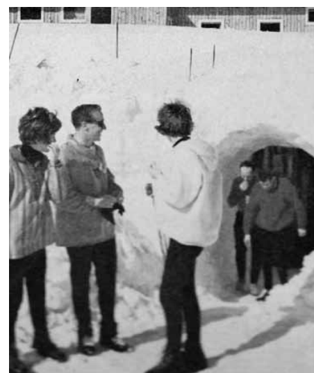
Tunnel entrances like this one to The Man Hotel were a common feature for many buildings during the 1964 epic snow season.